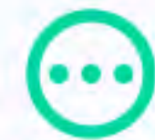
And many more